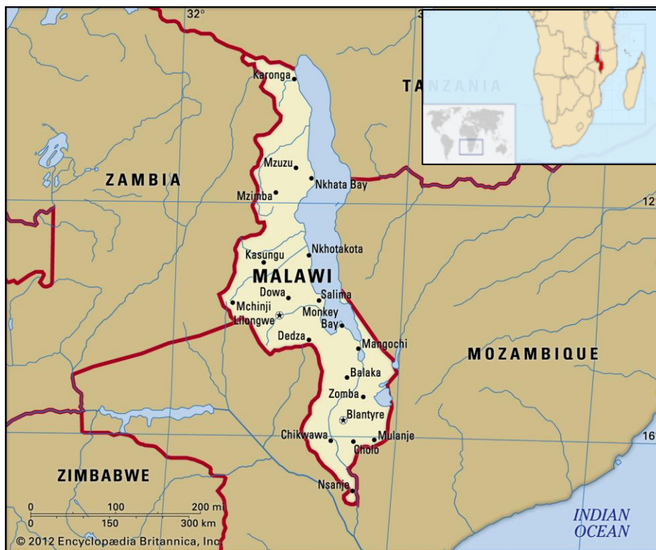
Figure 1. – Malawi.

may be attributed in part to government policy aimed at improving female literacy and promoting more-effective contraceptive methods (Ingham et al, 2021). The last census was carried out in 2018. According to its statistics the size of the population is 17,563,749. This is an approximate 35% increase in a decade, as the 2008 census enumerated 13 million residents. Life expectancy is 61.1 for men (79.4 in the UK) and 67.4 for women (83.1 in the UK) (UNDP, 2020; ONS, 2021). Although Malawi is one of the most densely populated countries in southern Africa, it is also one of the least urbanized, with more than four-fifths of its people living in rural locations. The official languages are Chichewa and English.