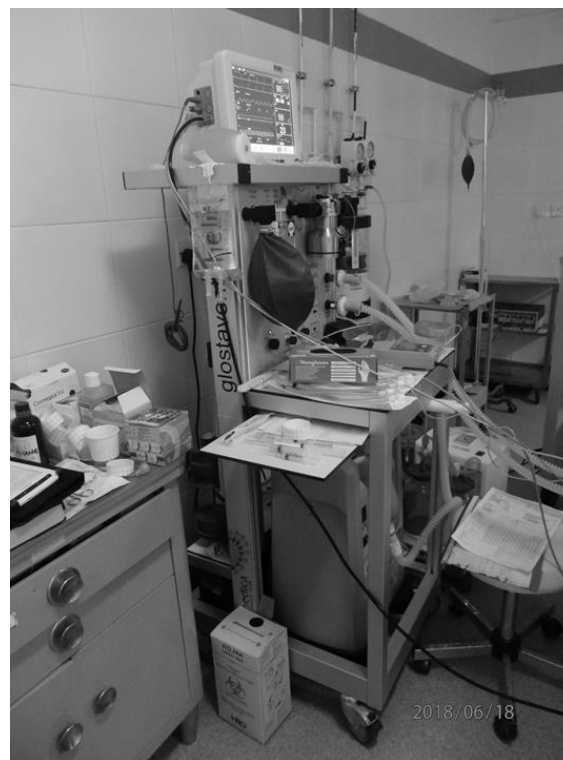
Figure 4. – Glostavent ® anaesthetic machine.

Anaesthetic machine - For general anaesthesia, a Glostavent ® machine was used ( Figure 4 ). This machine has been designed to enable anaesthetists practicing in adverse conditions to overcome the difficulties they are likely to encounter. It consists of a draw over system with an Oxford Miniature Vaporizer (O.M.V.), combined with a Manley Multivent ventilator and an oxygen concentrator. The concentrator has been modified so that, in addition to oxygen, it can also produce air under sufficient pressure to drive the ventilator. It can be easily maintained and serviced using local skills and continues to function in the absence of soda lime, nitrous oxide, oxygen or electricity (Eltringham, 2003).