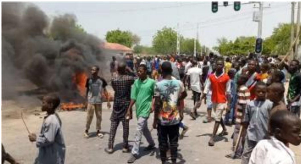
Figure 2. Protesters burn tires as they block the main road in Maiduguri on 30 June 2019, during a demonstration calling for a ban on the anti-Boko Haram CJTF militia they accuse of abuses after the killing of a rickshaw driver.

In Figure 2, the riot is induced by the killing of a rickshaw driver who didn't stop at the CJTF checkpoint and got shot by the CJTF. The residents called for the ban of the CJTF. According to some residents, that was the last drop.