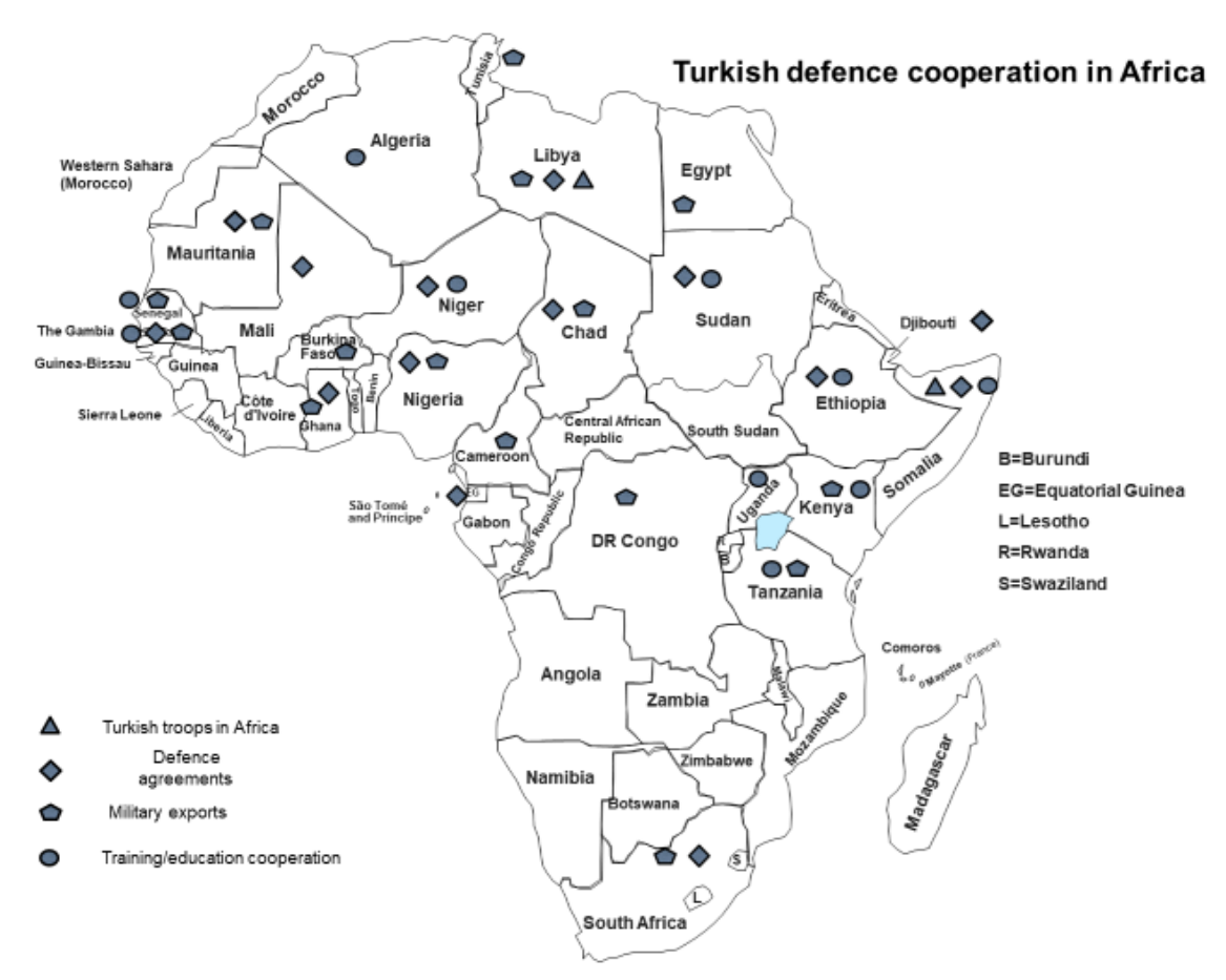
Figure 3. Turkish defence cooperation in Africa