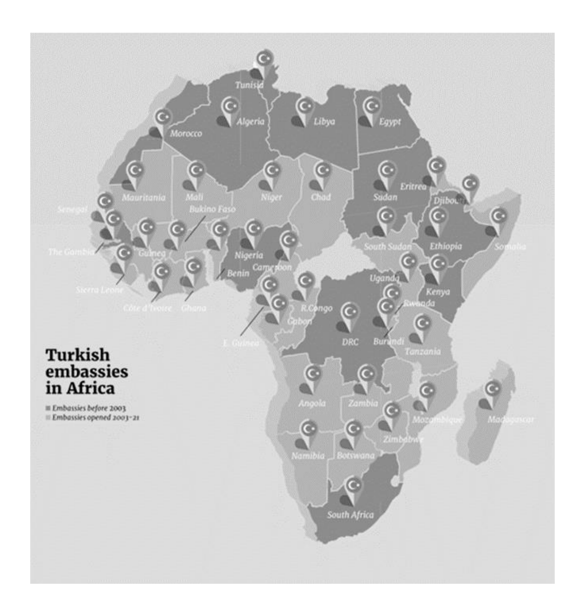
Figure 2. The number of Turkish embassies in Africa has increased from 12 in 2003 43 in 2021.

Another important indicator to show the strengthening connections between Turkey and the African countries is the economy. Turkey's trade with the African continent is nowadays more than 4 times bigger than in 2003. In 2003, it was 5.4 billion USD, and in 2020, it was 25.3 USD. The goal of Turkey to even double this number to 50 billion USD in the coming years. For example, in Ethiopia, Turkey is the second biggest investor. (Mitchell 2021) Turkey has become the third largest importer of Algerian products, and the two countries aim to boost trade to 4.1 billion euros a year. (France24 2021) Turkish Airlines has more and more destinations in Africa, becoming an important company for people to reach Africa and for Africans to reach the world. There were already two Turkey-Africa Partnership Summits (2008, 2014) and the Third Turkey-Africa Partnership Summit was organized under the auspices of Recep Tayyip