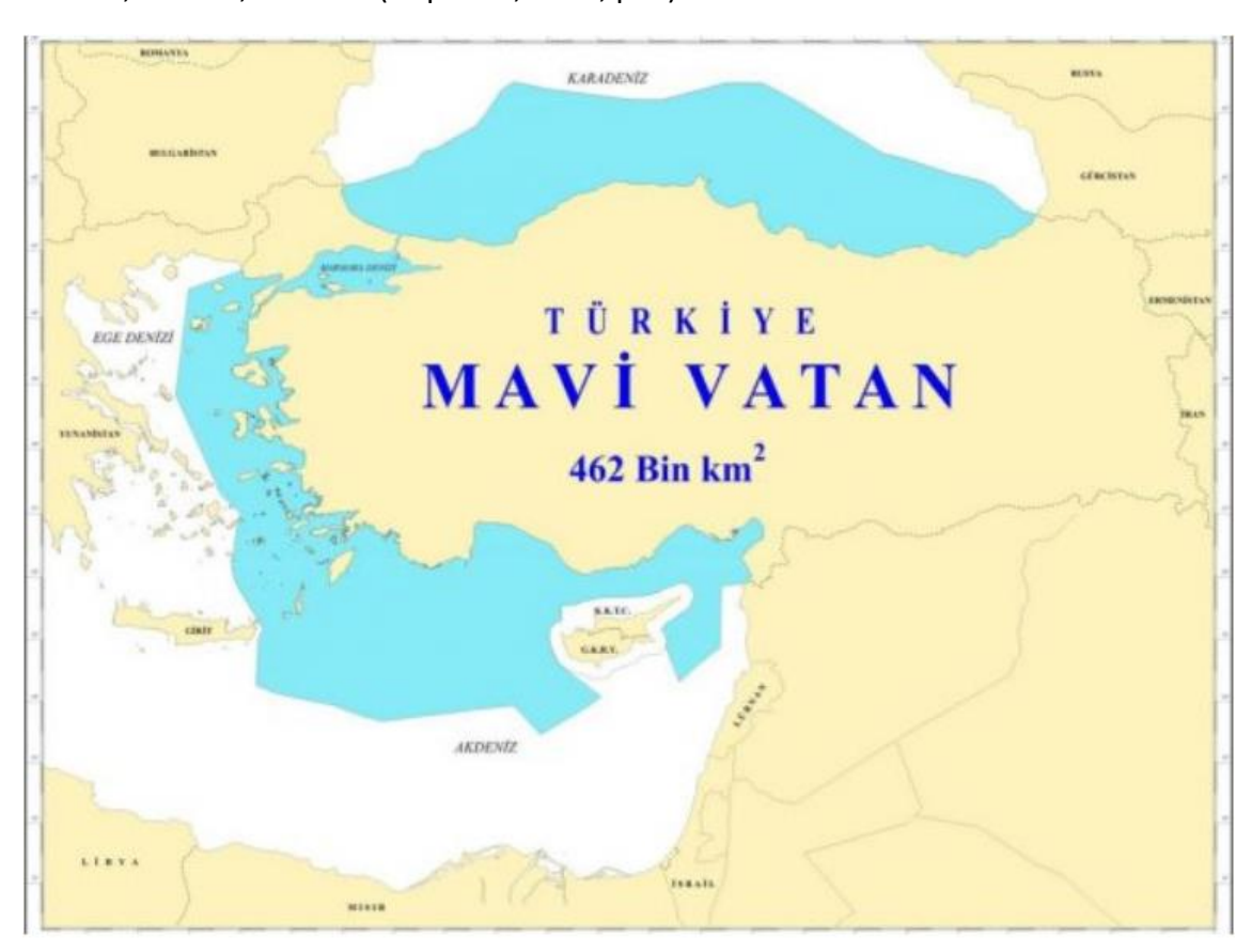
Figure 2: Blue Homeland: Turkey's expanding naval horizons in Mavi Vatan

this effort is now visible not only on land (e.g. Syria, Libya) but also at sea (Mediterranean). The advocacy strategy is that Turkey has spent significant financial resources in recent years on building a strong navy. According to Turkish plans, a total of 24 new ships will be completed by 2023, including four frigates. The expansive direction is also reflected in the concepts of Turkish foreign policy, according to which the Turkish Homeland (vatan) is not meant exclusively for the mainland (Anatolia), but also for the Blue Homeland, i.e. the seas (mavi vatan). The term was first used by Admiral Ramazan Cem Gürdeniz in 2006 (Gürdeniz, 2018), while in geopolitics the term was used from March 2019 after a naval exercise. Between 27 February and 8 March 2019, the largest naval exercise in the modern history of Turkey was held under the name "Mavi Vatan". The operation in the Black Sea, the Aegean Sea and the Mediterranean involved 103 warships, submarines, and other ships, as well as drones. All of this symbolically marked the expanding direction of Turkish foreign policy towards the "blue homeland," that is, the seas (Tsiplacos, 2019, p. 6).