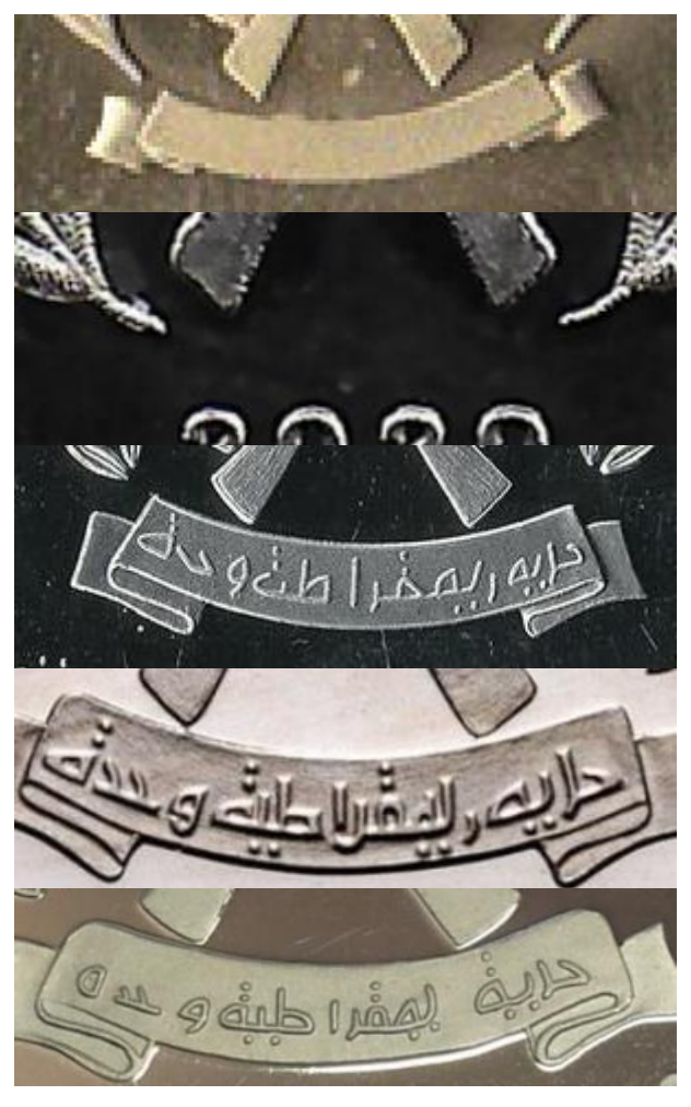
Figure 5. The ribbons of the stylized coat of arms

In stylized coats of arms on tokens, the motto on the ribbon (as well as the ribbon itself) may be absent or may contain spelling inaccuracies (Figure 5).