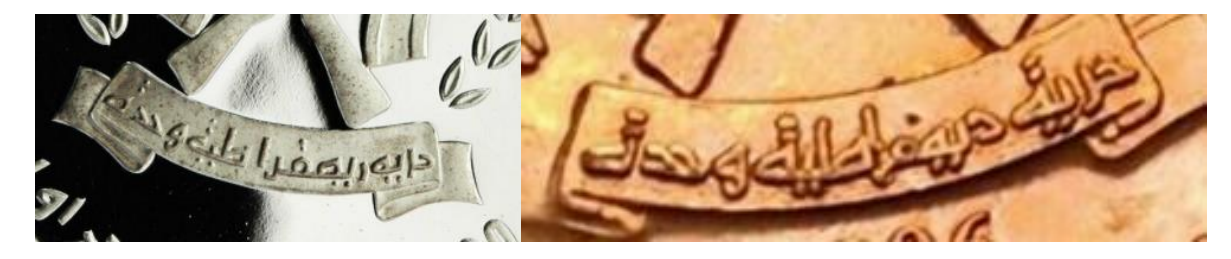
Figure 4. The ribbon of the official coat of arms of the SADR

Despite this, the stylized coat of arms of the SADR before modification is used on Cuban tokens of 1990-1997, as well as on bimetallic tokens of 2004-2010 and the series of tokens of 2018 and 2020.