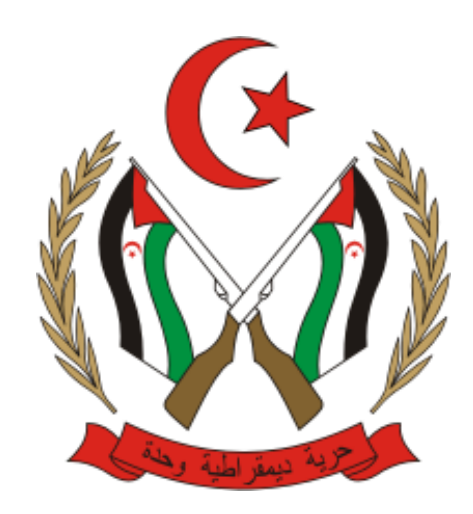
Figure 3. The official coat of arms of the SADR after modification in 1991

The stylized coat of arms of the SADR on tokens differs much from the official coat of arms. The photo in Figure 2 shows the official coat of arms of the SADR of 1976 type, for which in 1979, Mohammed Abdelaziz, the President of the SADR, receives a letter of credence from the Ambassador of Mexico to the SADR (La República Árabe Saharaui Democrática: Pasado y Presente, 1985).